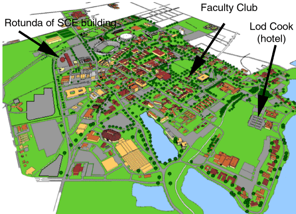
The rotunda looks like this (it's round)